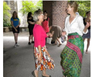
Not your typical French Class