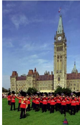
Ottawa - Changing of the guard